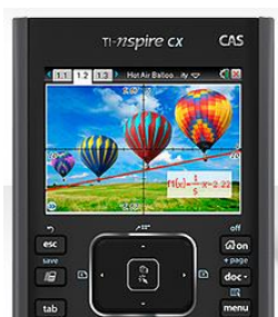
Permitted on SAT & AP Exam

Notice: The TI-Nspire CAS (CAS stands for Computer Algebra System) and TI-89 ARE NOT allowed for the ACT, but are allowed for the SAT & AP exam.